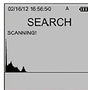
Real-time spectrum display